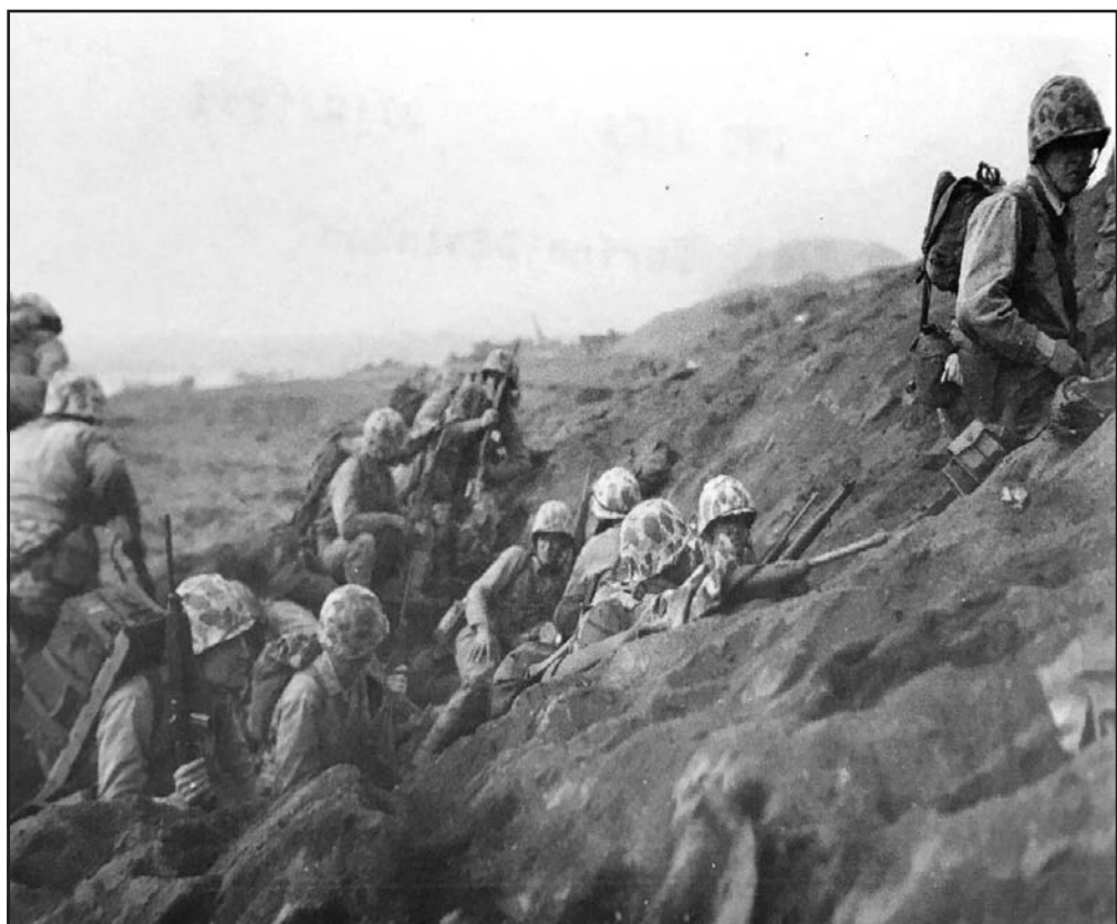
This picture shows U.S. Marines holding a position at Iwo Jima.